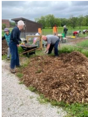
Mulch covering was the last step before seeding.