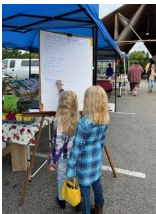
At New Berlin Farmers' Market, two youngsters sign on to Zero Waste's Skip the Straw campaign