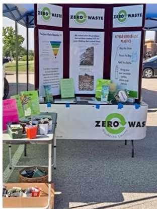
Zero Waste display at Brookfield Farmers'